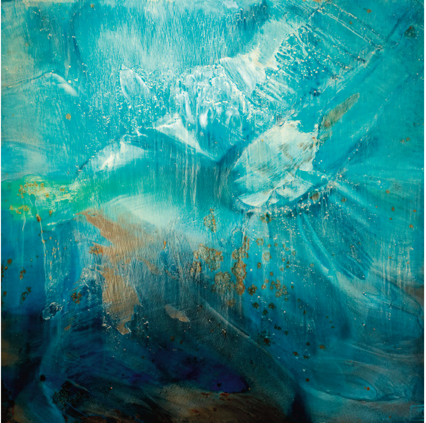
Dreams of a Floating World

Some of William's recent accomplishments include: