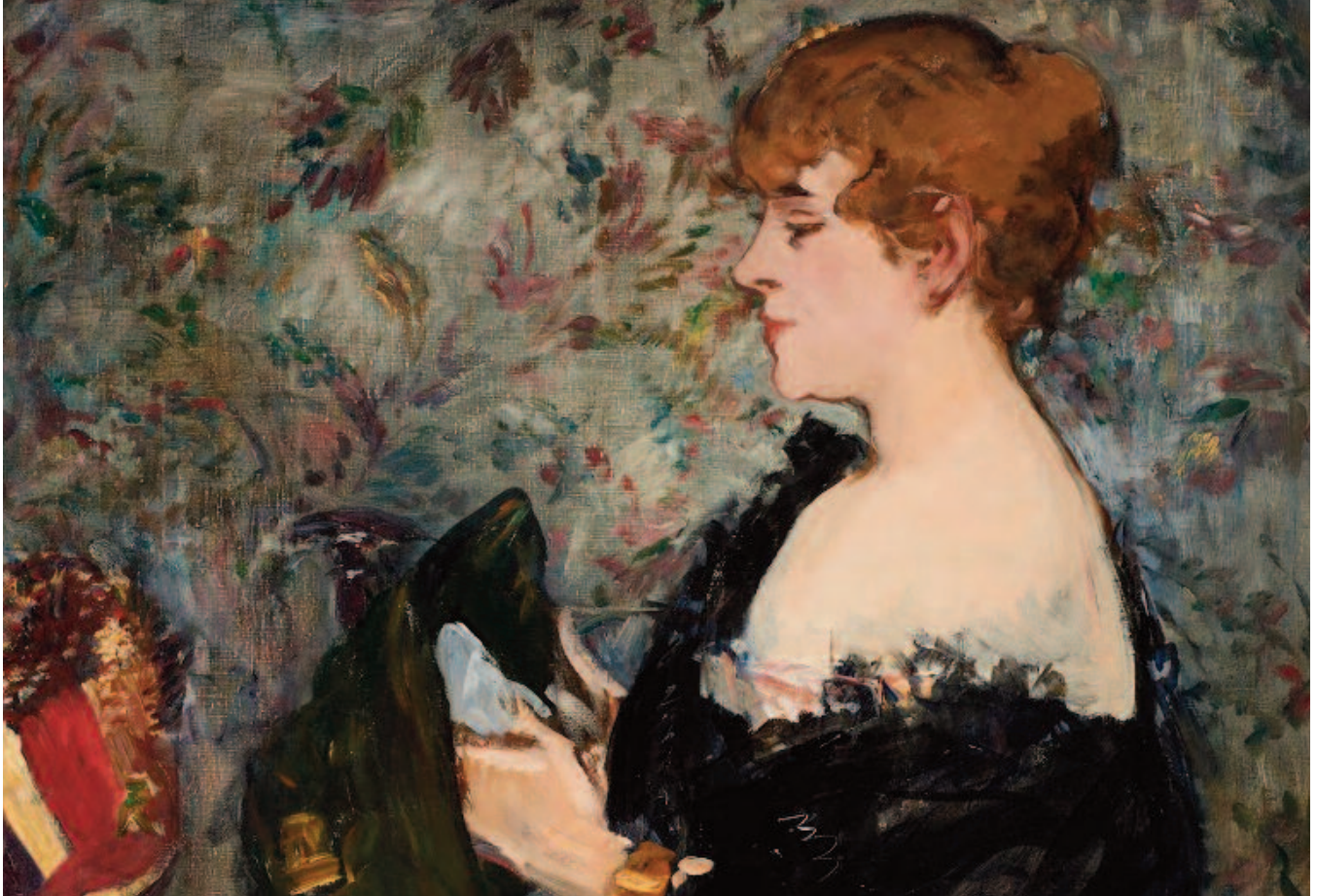
Édouard Manet, "At the Milliner's (La Modiste)," (detail) 1881. Oil on canvas, 33 1/2 x 29 in. Fine Arts Museums of San Francisco, Mildred Anna Williams Collection.