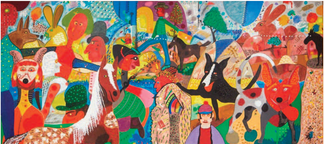
Roy De Forest, "40 Miles West of Rabbit Corner," 1981. Polymer on canvas, 75.5 x 170 in. di Rosa Collection, Napa.